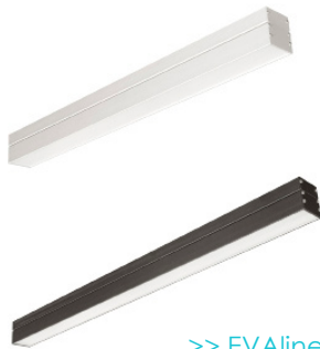
>> EVAline Aqua HE luminaire

EVA Optic is specialist developer of high quality LED solutions for swimming pools and indoor sports facilities. All products are developed and manufactured inhouse in the Netherlands.